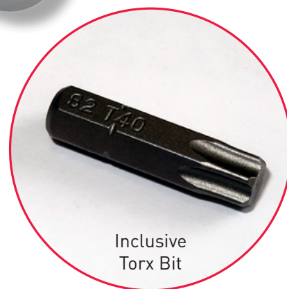
Inclusive Torx Bit

PM MOUNTING SCREW is used to fasten dimpled and drainage membranes to perimeter insulation made of pressure-resistant XPS insulation material. The plastic dowel has a coarse, conical thread and a TX 40 flat head drive.